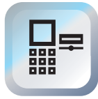
Point of Sales